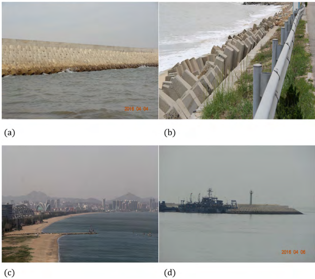
Fig. 1. Major hard engineered defences along China's mainland coast: (a) seawalls; (b) man-made bars for transportation; (c) groynes; (d) sheltered structures.