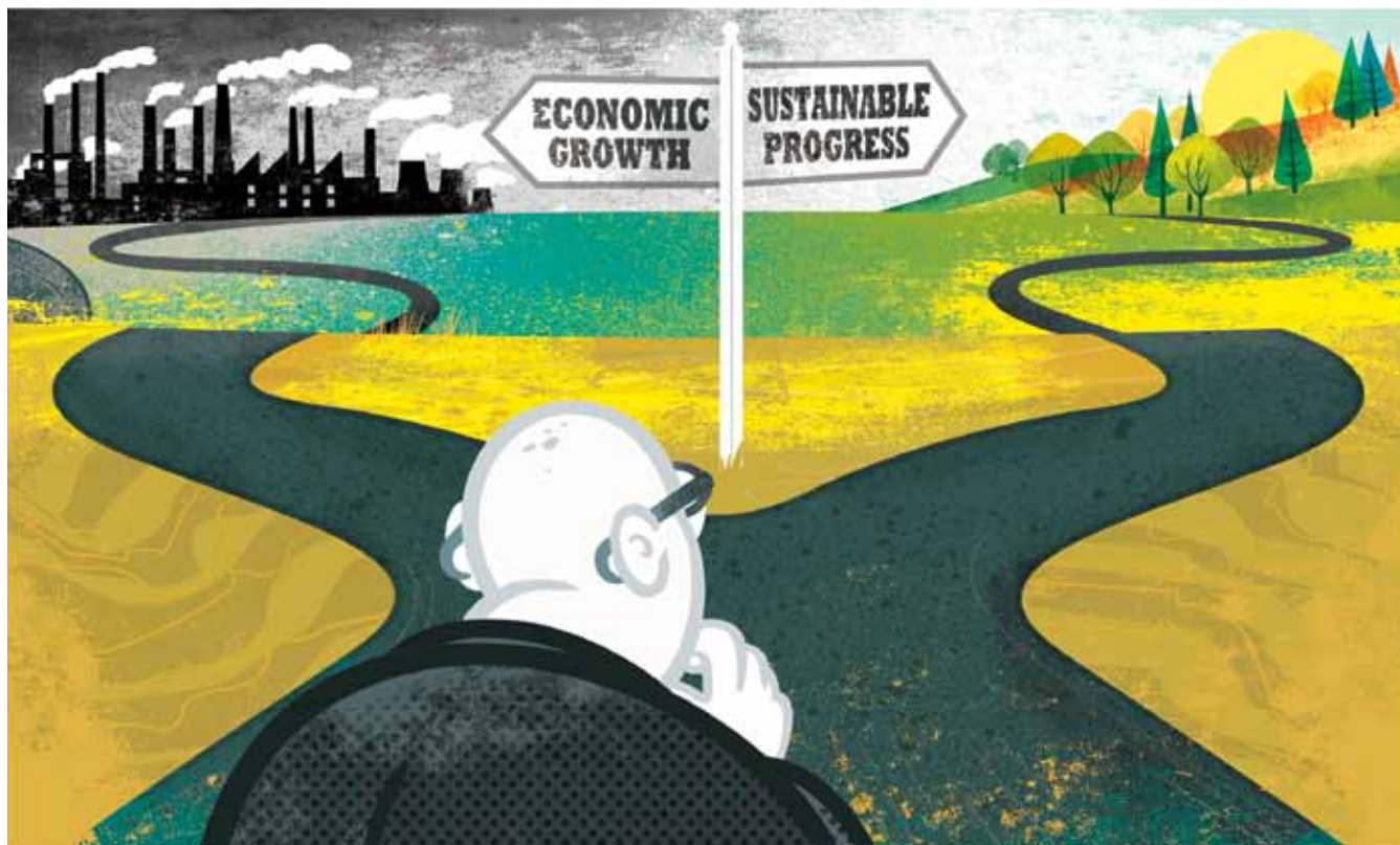
ILLUSTRATION BY PETE ELLIS/DRAWGOOD.COM

FUNDING Grant applications should feature multimedia presentations p.291