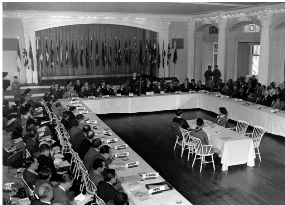
Bhutan has measured citizens' well-being using gross national happiness since 2008 (left); GDP has been in use since the 1944 Bretton Woods meeting (right).

of the 2012 Rio+20 UN Conference on Sustainable Development agreed to by all UN member states.