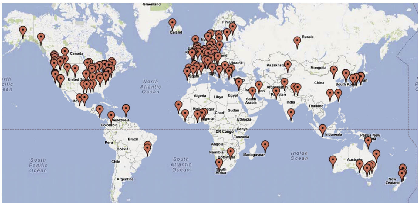
Fig. 1. Participants from 49 countries and 210 cities.

The second part of the conference (days two and three) included a second plenary session with Steve Polasky, Pushpam Kumar, and