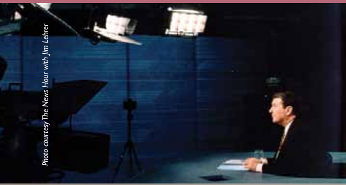
Jim Lehrer on the set of The News Hour on PBS. Americans named PBS the most trusted, least biased nationally known institution.