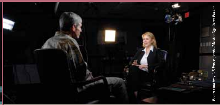
Air Force Chief of Staff Gen. Norton Schwartz answers questions during an interview with Lara Logan from 60 Minutes.